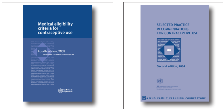
Medical eligibility criteria for contraceptive use